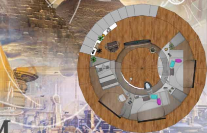
GROUND FLOOR PLAN AREA: 64 METRE SQUARE

The Atom is designed from an architectural point of view which focus more on functional spaces besides considering the basic technology required to live on Mars.